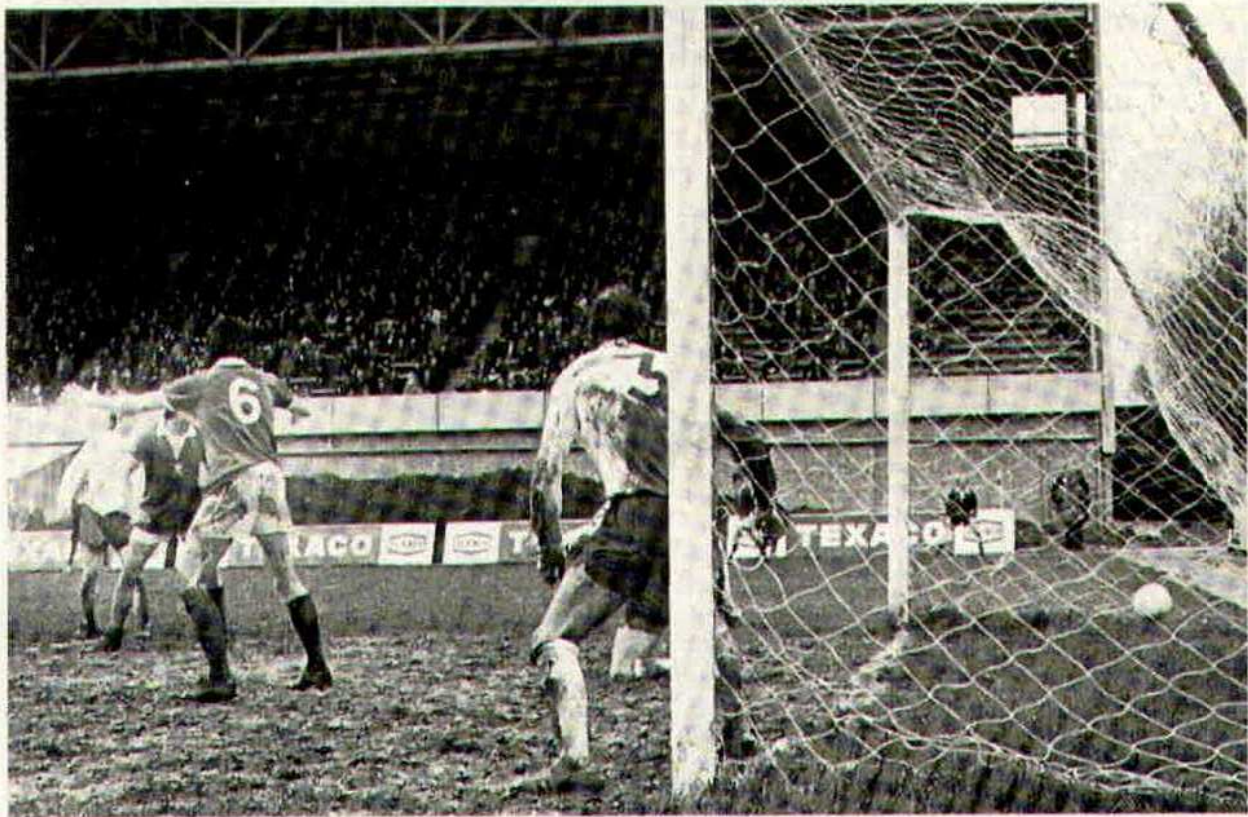
Peter Eastoe scores Swindon's equalising goal against Crystal Palace