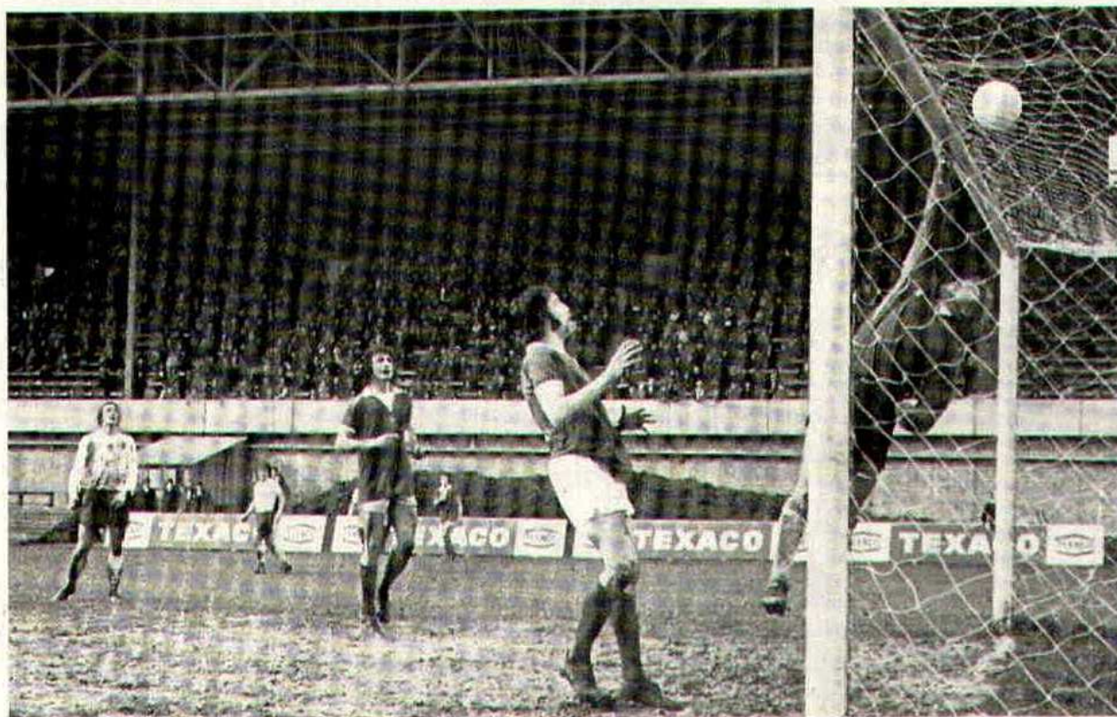
Another Swindon attempt to score is foiled by Burns.